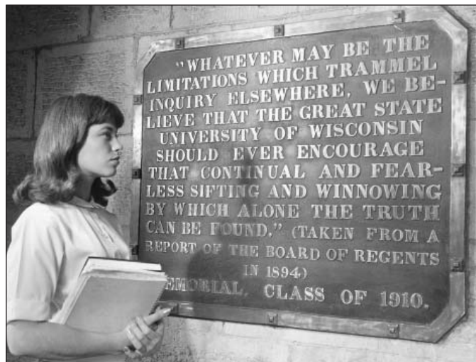
Sifting and Winnowing Plaque.

As with most conflicts of consequence, most people know of them, while many live in ways that enable them to ignore or avoid them altogether. Such is the case with the various struggles over higher education in the United States that erupted over the past century, characterized in a turn on James Davison Hunter's phrase as the Campus Wars. These struggles are the result of persistent and perhaps natural ideological tension between professors and