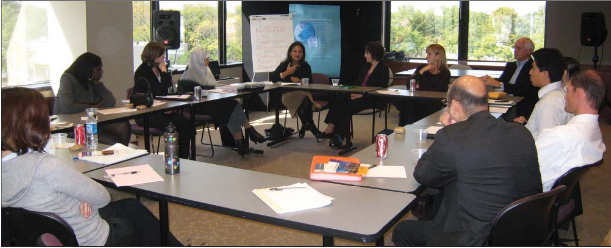
Above: Development Career Intensive Panelists from USAID, World Bank, Bread for the World and ARD.