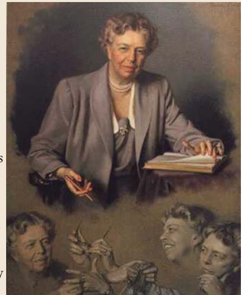
Above: Eleanor Roosevelt.

As Eleanor debated how to continue a public role after FDR's death, the central issue was which arena would give her the stage from which she would have the most impact. "Of one thing I am sure," she wrote, "in order to be useful we must stand for the things we feel are right, and we must work for those things wherever we find ourselves. It does very little good to believe in something unless you tell your friends and associates of your beliefs."